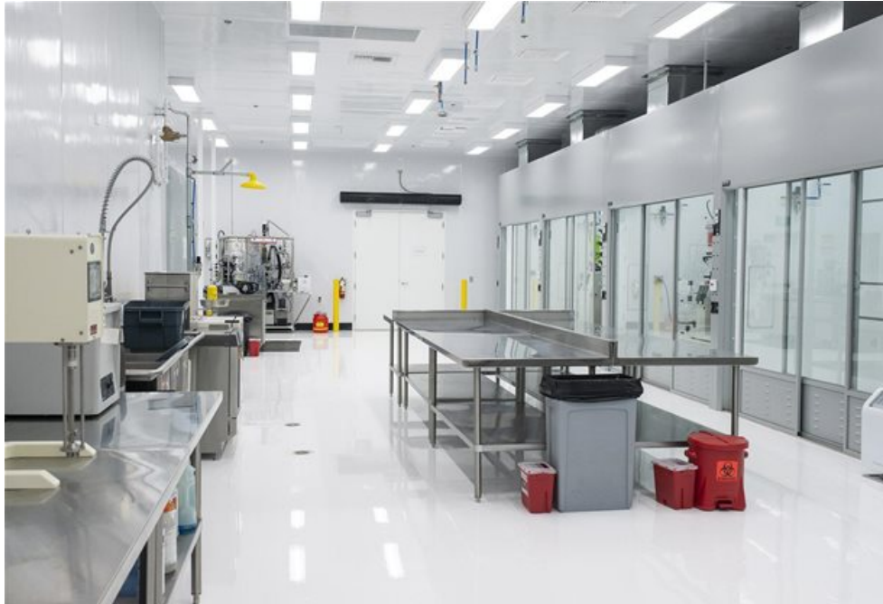
Photo: City Trees production facility, Las Vegas, NV

Founded in 2017, City Trees is a Nevada-based cannabis cultivation, production and distribution company. Offering a wide variety of products with consistent results, City Trees products are available in numerous dispensaries throughout the state of Nevada. https://citytrees.com